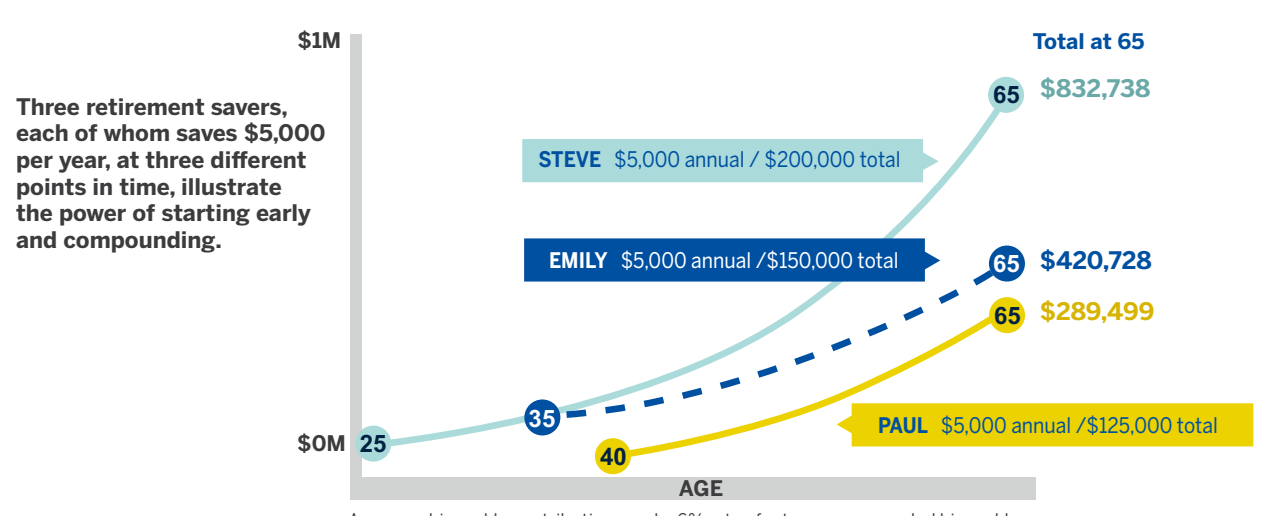
Exhibit 1: GROWTH OF SAVINGS

Assumes bi-weekly contributions and a 6% rate of return, compounded bi-weekly. There is no guarantee that investors will experience the type of performance reflected above.